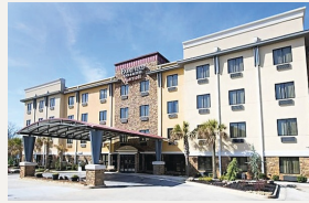
Fairfield Inn & Suites 678-971-4670