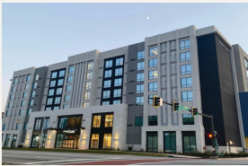
Courtyard By Marriott *walking distance 770-532-4508