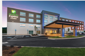
Holiday Inn Express & Suites 770-533-5140

There are plenty of accommodation options for your group.