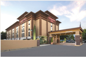
Hampton Inn & Suites *walking distance 770-503-0300