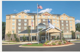
Hilton Garden Inn 770-532-3396