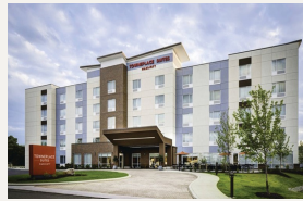
TownePlace Suites 678-971-4102